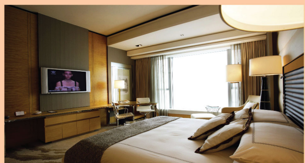
Comfortable & Secure @ Serviced Commercial Suites