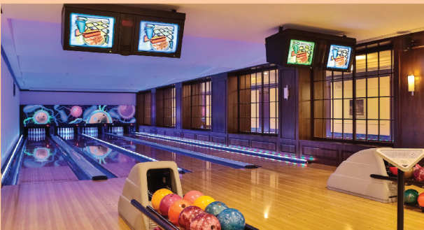
Fun & Masti @ Family Entertainment Centre