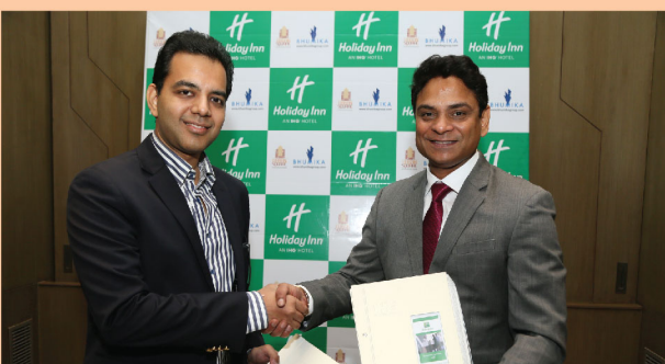
Five Star Hospitality @ Hotel Holiday Inn