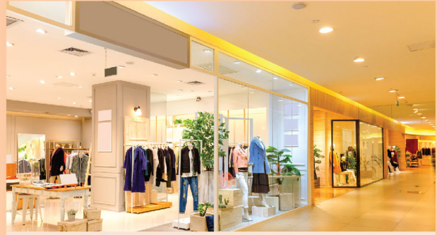
Style and Fashion @ A Retail Destination