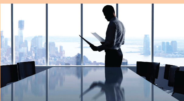
Business Success @ Office Suites