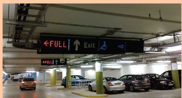
Ease of Access and Egress