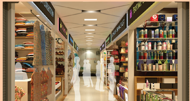
Bargain Hunting @ Haat Bazaar