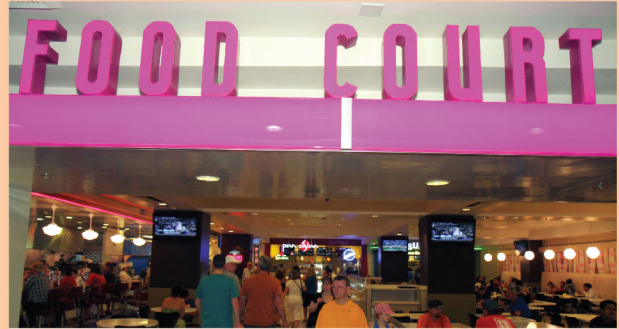
Finger- Licking Good @ Food Court