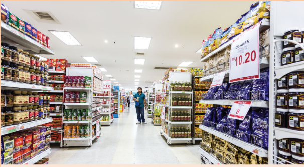
Best Buys @ Hypermarket