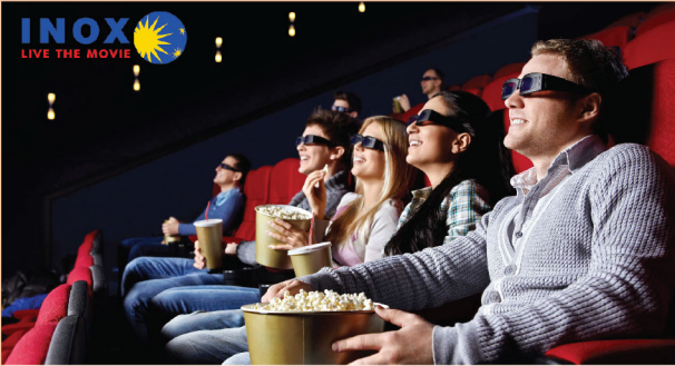
Movie Magic @ INOX Insignia