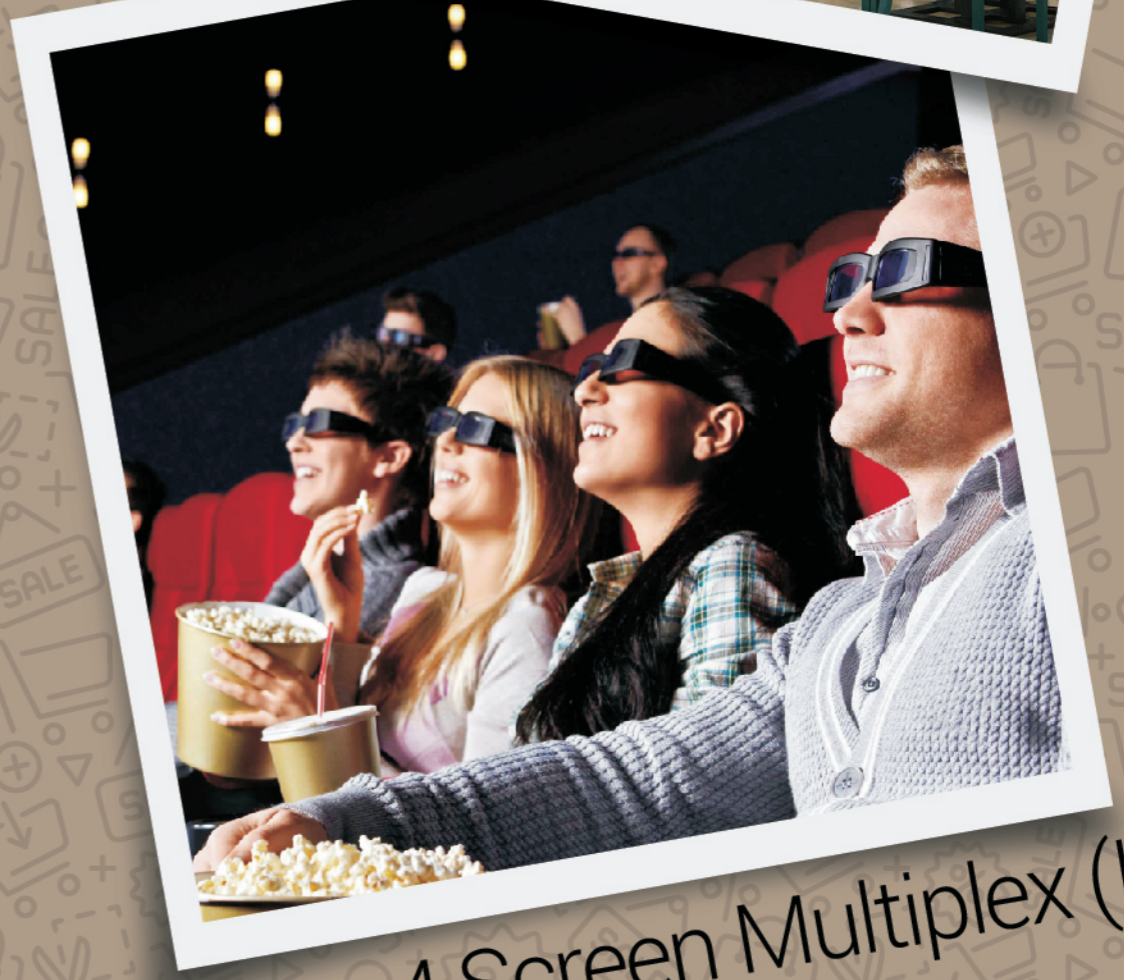
4 Screen Multiplex (INOX)